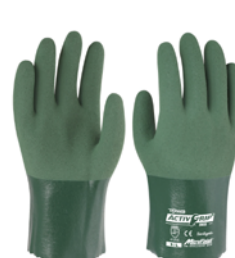
ActivGrip 565: 10 inch (26cm)