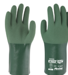
ActivGrip 566: 12 inch (30cm)