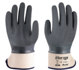
ActivGrip 588: 10 inch (26cm)