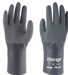
ActivGrip 586: 12 inch (30cm)